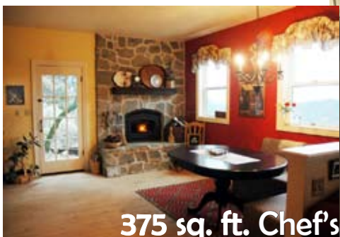
375 sq. ft. Chef's fireside eat-in kitchen

Homeowner is downsizing/relocating -- MOST FURNISHINGS ALSO AVAILABLE.