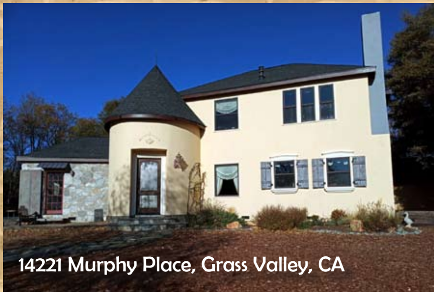
14221 Murphy Place, Grass Valley, CA

Picturesque & peaceful hilltop haven w/ "see forever" VEWS