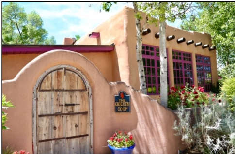
Chicken Coop: 1,260 sq. ft., 2 Full Baths, Large Multiple Purpose Room, Kitchen, Patio & Hot Tub.