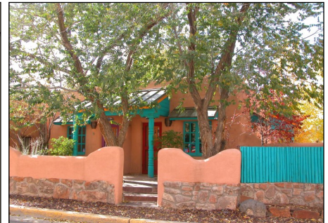
2 Casitas: Each 420 sq. ft., 1 Bed, 1 Bath, Kitchen, LR w/ painted murals and cabinetry by artist Jim Wagner.