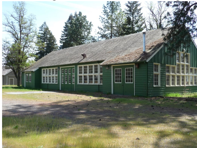
Building #2101—Maintenance Shop

The Rogue River -Siskiyou National Forest is selling the L Street Administrative Compound consisting of 2.66 acres of land and 7 buildings in Grants Pass, Oregon.