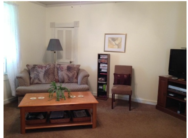
DEN / BEDROOM