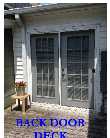
BACK DOOR DECK

Located in Spencer's Historical District, close to worship, shopping and schools, this beautiful home is 35 miles from the Charlotte Motor Speedway; it's also within walking distance of the North Carolina Transportation Museum! Large, spacious rooms: all appliances (including a washer and dryer), complete new wiring, new flooring, new roof (March 2014), conditioned crawlspace all combine to make this a very special home. Three bedrooms, one bath. $67.5k. (704.633.1013)