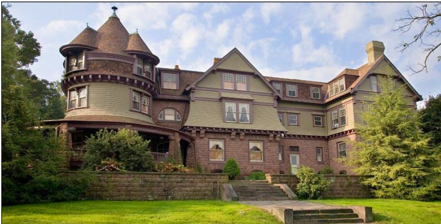
HISTORIC BROOKE MANSION - 3 STORY CUT SANDSTONE & CEDAR SHAKE MANSION (Approx. 14,000 sq. ft. living space)

Located at 301 Washington St., Birdsboro (19508), Berks County, PA (Directions: Rt. 422 east of Reading to Rt. 82 South to Birdsboro, right on W. 1st St, left on Washington St.)